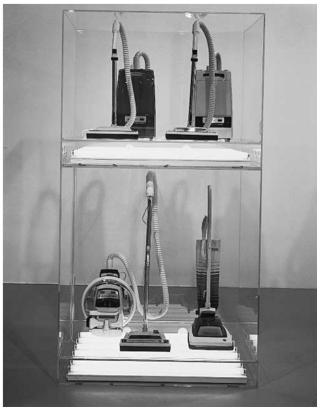
6. New Hoover Quadraflex (1981–6) by Jeff Koons. The fine art of museum display is applied to ordinary consumerist objects.