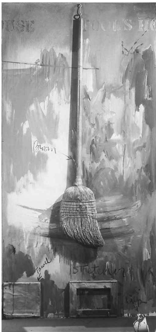
5. Fool's House (1962) by Jasper Johns. Language, theory, the object, and art. Is this a paint brush?