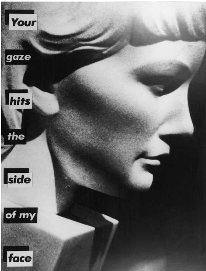
17. Untitled (Your gaze hits the side of my face) (1981) by Barbara Kruger. Art with a message: how violent is the male gaze?