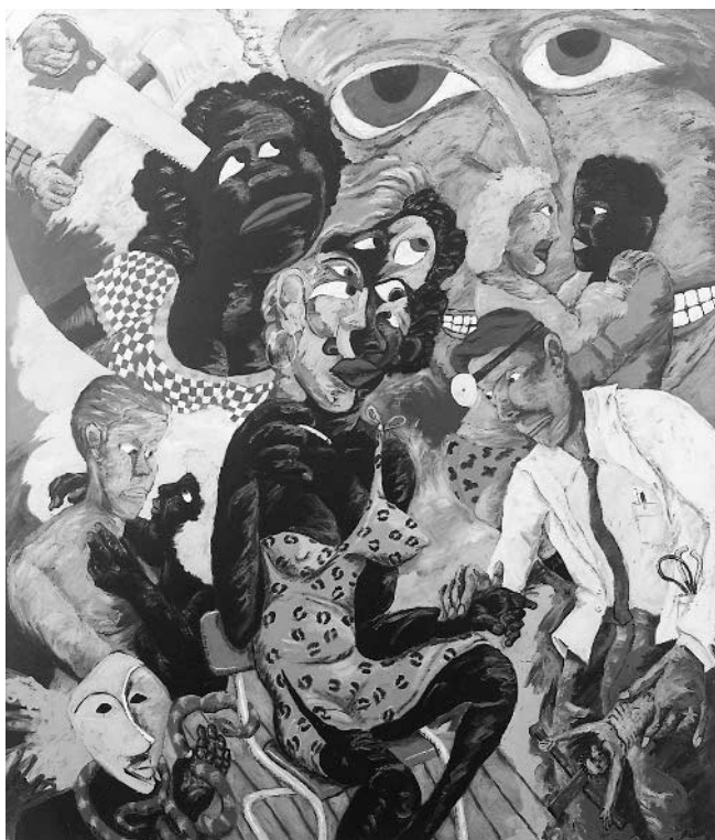
19. Grandma and the Frenchman (Identity Crisis) (1990) by Robert Colescott.

And doesn't the expression of personal identity demand an imposed narrative and a realist mode?