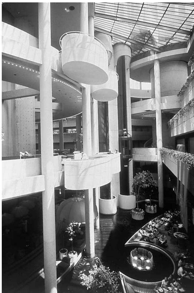
1. Interior of Westin Bonaventure Hotel by Portman. 'Postmodernist hyperspace'.