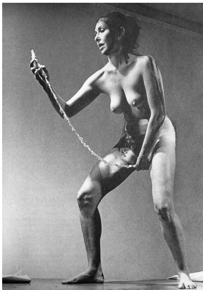
15. Interior Scroll (1975) by Carolee Schneeman. We write with the body, but with what sense can women's writing also come from the body?