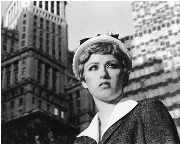
3, 4. Untitled film still (1977) by Cindy Sherman. Cindy Sherman as Hitchcock or as Antonioni might have seen her; but didn't.