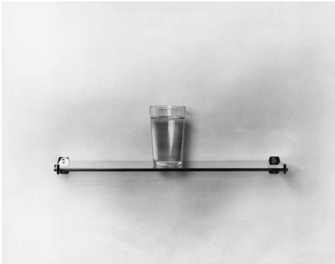
10. An Oak Tree (1973) by Michael Craig-Martin. Sometimes a cigar is just a cigar (Sigmund Freud, attrib.).

Q Haven't you simply called this glass of water an oak tree?