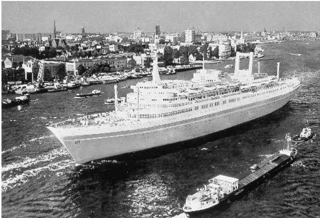
7. SS Amsterdam in Front of Rotterdam (1966) by Malcolm Morley. Is this just a big ship, or a statement about the nature of art?

Many modernist works aimed at a kind of self-explanatory autonomy (‘all you need to understand’ Four Quartets , in particular,