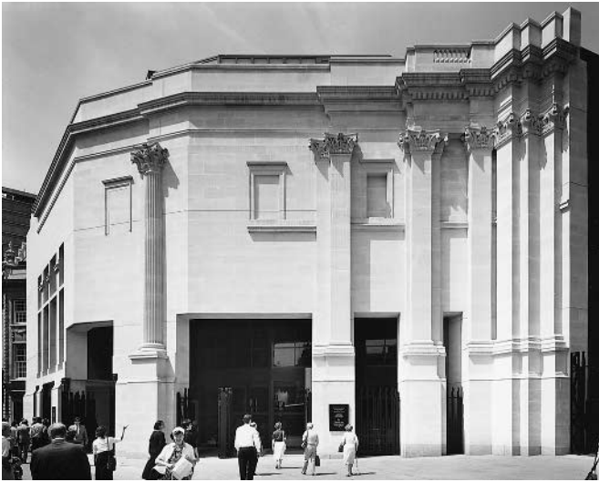
12. Sainsbury Wing, National Gallery, London (1991) by Venturi, Scott Brown and Associates. A new building, but a pastiche of earlier styles. Is this ironic?

the pilasters, for example, or thoroughly unclassical garage-door-type openings hacked out of the elevation for the entries, windows and loading docks, at once undermining the classical sensibility and contradicting the tectonic logic otherwise so emphatically registered. Each classical detail or abundantly redundant element stands in counterpoint to another that undermines or contradicts classical verities. For Venturi and Scott Brown, contemporary cultural and social diversity calls for an architecture of richness and ambiguity rather than clarity and purity.