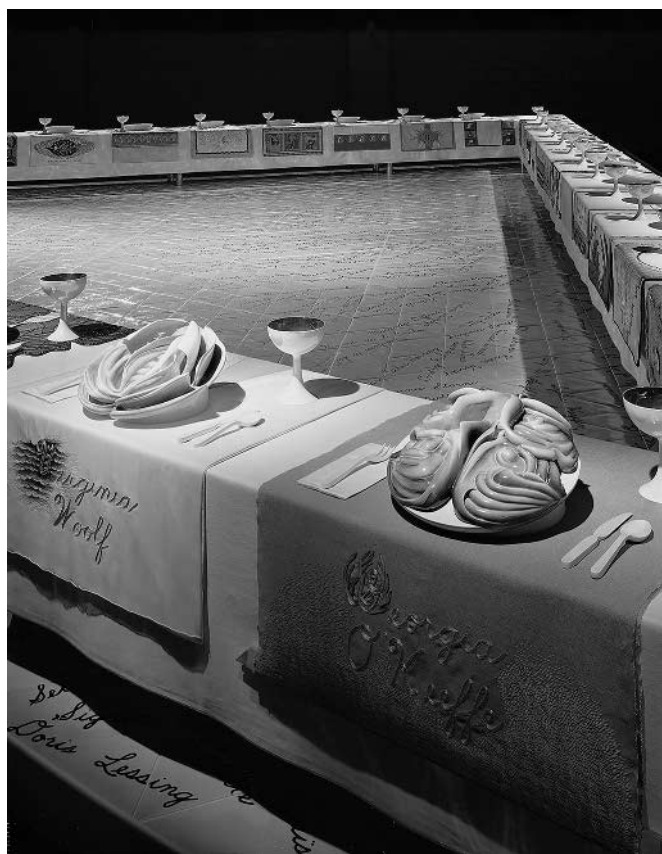
14. The Dinner Party (1979) by Judy Chicago. A feminist symposium: but are the identities of the participants constrained by the imagery used to 'represent' them?