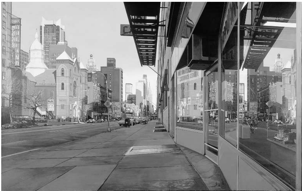
8. Holland Hotel by Richard Estes. A dangerous formal beauty, retrogressively modernist?