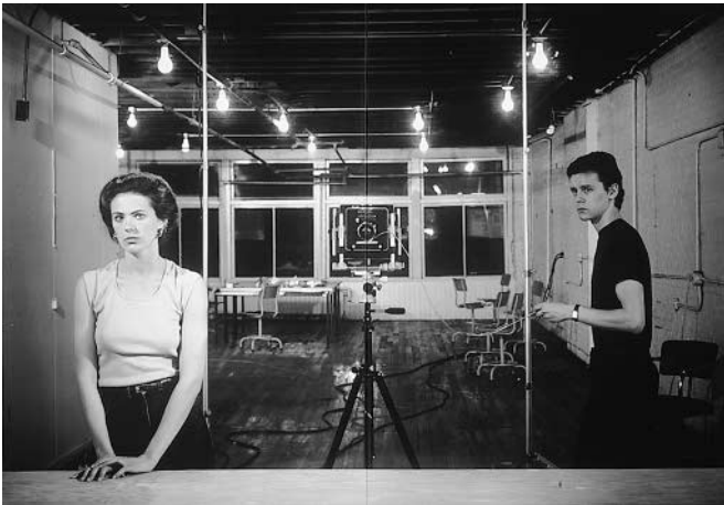
11. Picture for Women (1979) by Jeff Wall. Who looks at whom, at what angle, and why?