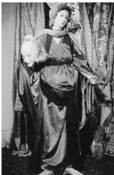
16. Untitled, #228 (1990) by Cindy Sherman. Acting out and the threat of castration: is Judith's story also Cindy Sherman's?