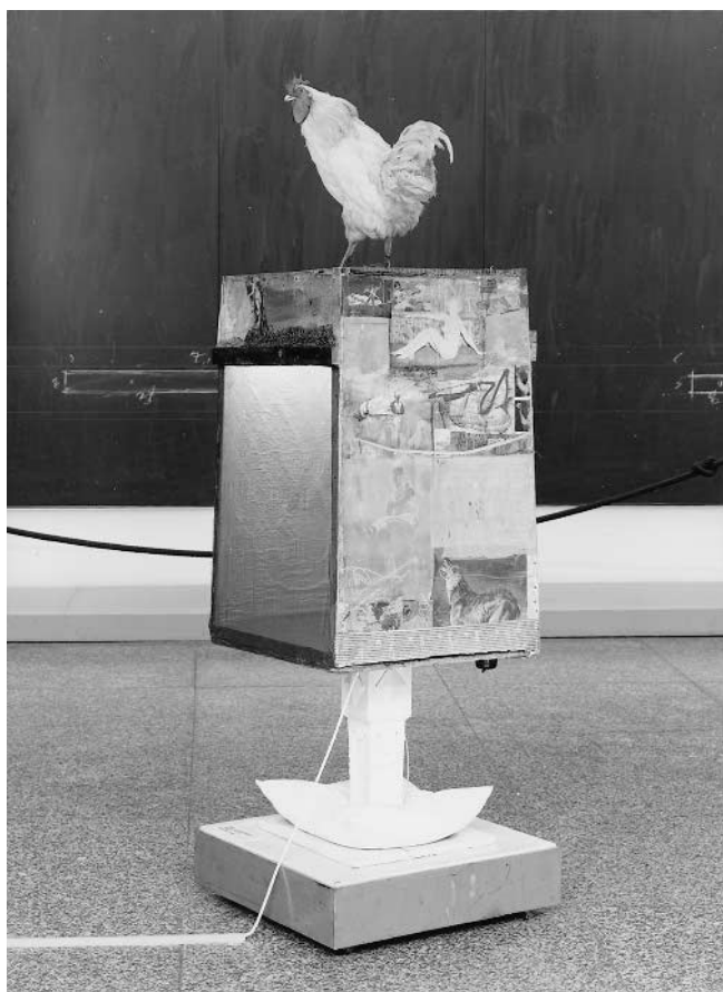
21. Odalisk (1955–8) by Robert Rauschenberg. 'Image leads to relativism leads to doubt.' Then what is the bird doing on top of it all?